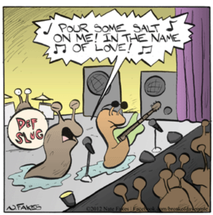
Def Slug was a very dark band.

The TATTLER is an aggregator of industry news and views about the participants in all the events and activities of the non-profit Conclave. The opinions expressed on these pages do not necessarily reflect the views of the Conclave Board and/or Conclave sponsors. Differing opinions are welcome. Email: <a href="mailto:mailto:tomk@theconclave.com">mailto:tomk@theconclave.com</a>