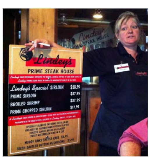
Some spent their Conclave free time in pursuit of fine Twin Cities culinary fare that only cows can provide

NEXT WEEK IN THE TATTLER: What various trades/ websites/social media had to report about the 2012 Conclave Learning Conference!