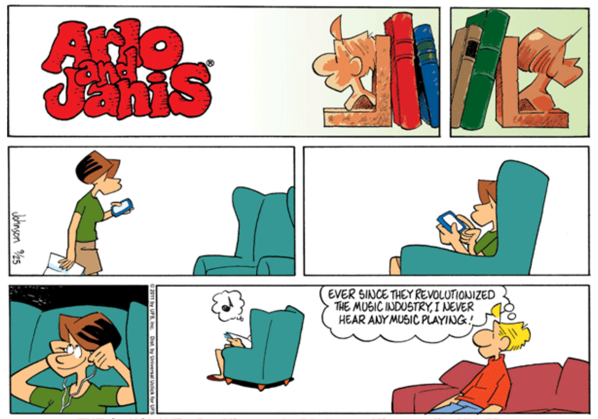
THE CONCLAVE, 4517 Minnetonka Blvd #104, Minneapolis, MN 55416