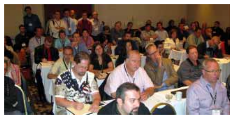
Standing room only for the all-star "What's Next" session!

there" showing up to meet the audience, "be local," "be like Bob: (a personality who accepts every job thrown at him and is deeply connected in his community), "be in sales" (so important to clients that they'll pull their ads if you leave), and "be initiating."