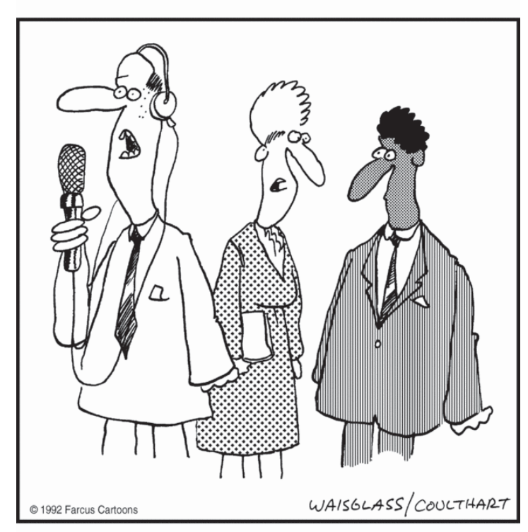
"He loves to hear the sound of his own voice."

THE CONCLAVE, 4517 Minnetonka Blvd #104, Minneapolis, MN 55416