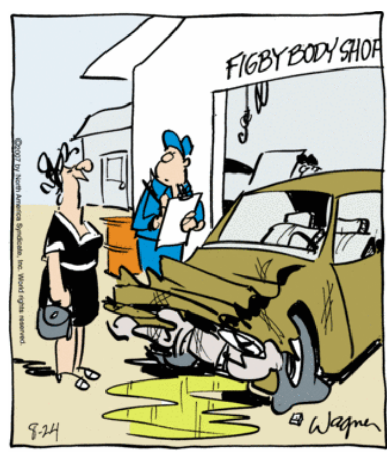
"Can you save the satellite radio?"

looking for talent. No specifics. If you believe in yourself and can tell great stories on the air, rush your best to: talent@federatedmedia.com...Connoisseur Media Country WBBE/Bloomington, Il needs a hard-working, passionate PD. Make a difference in a growing market. Resume and Audio to: jswart@connoisseurmedia.com...The Conclave is still gathering resumes for a part-time assistant to help with the important task of helping put together the 2009 Learning Conference. If you live in the Twin Cities area, have a few hours a week to help with a myriad of details surrounding the July conference, enjoy meeting/ speaking with the movers & shakers of the industry, and are willing to work for a small wage while gaining a giant education, send your resume to tomk@theconclave.com...All listings in Jobs represent equal opportunities and are provided free of charge. To place an ad, send particulars to: mailto:tomk@main-st.net no later than Thursday evening for Friday publication. No calls unless otherwise specified.