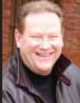
Ed Schultz Jones Radio