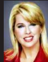
Rita Cosby Author/Commentator