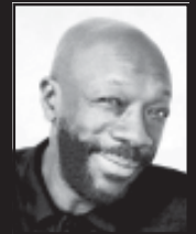
Isaac Hayes Artist/Songwriter