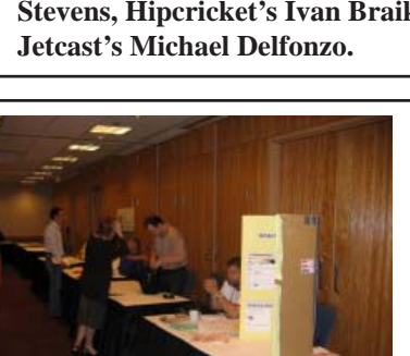
The Brown College-sponsored Job Fair was the most successful in Conclave history!