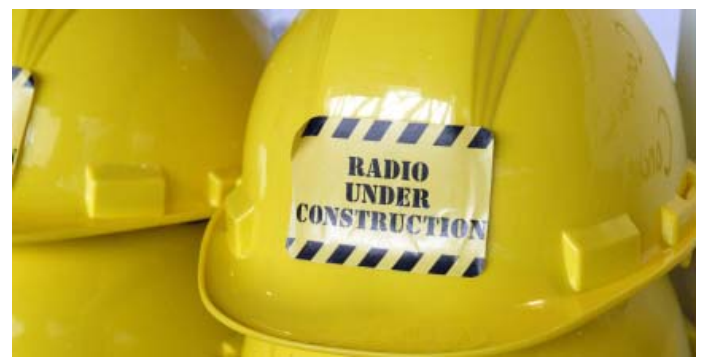
Proud partners of the 2007 Conclave Learning Conference: Platinum Partner - Radio and Records. Partners - Arbitron, AudioBitXChange/BitXChange, BMI, Brown College, Consolidated Media, Edison Media Research, Envision Radio Networks, Jones Radio Networks, Lincoln Financial Media, McNally-Smith College of Music, McVay Media, Media Span, Megatrax, MusicMaster, Musicrypt/DMDS, Nielsen Entertainment/BDS Radio, Play MPE, Premiere Radio Networks/Mediabase, PromoSuite, RCS, Troy Research and Specs Howard School for Communication Arts.

The 2008 Conclave Learning Conference: RADIOvation June 26-28, 2008 • Marriott City Center/Minneapolis Earlybird tuition $179. Register at www.theconclave.com.