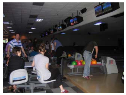
Thousands of dollars worth of prizes, including a big screen TV, were awarded at the annual Bowling Party, sponsored by BDS Radio/Jones Radio Networks.