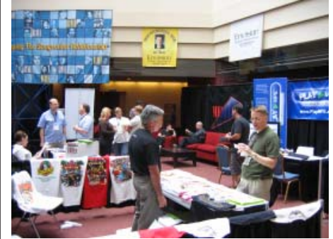
As always, the Learning Conference Exhibit Area becomes a learning area unto itself!