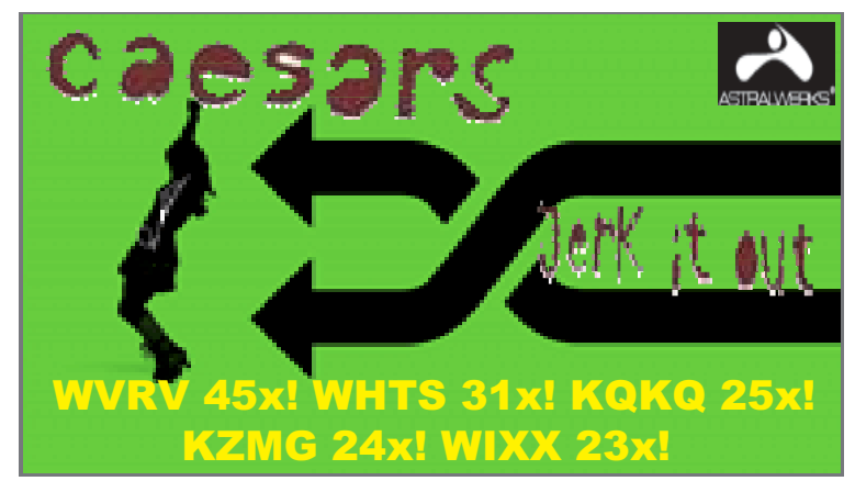
The 30<sup>th</sup> Annual Conclave Learning Conference – Hardcore Radio! July 20-24. Marriott City Center. Minneapolis. Tuition, just $399 until 5/30/05! Thursday only tuition (The Promotion Summit, Conclave College), just $99. Visit www.thconclave.com.

Grand Rapids Winter Book. Clear Channel country WBCT steps it up. WBCT-FM 9.6-12.9, WSNX-FM 7.1-7.7, WOOD-AM 8.9-6.9, WLAV-FM 5.4-5.2, WTRV-FM 3.4-4.9, WOOD-FM 5.5-4.8, WLHT-FM 4.6-4.4, WGRD-FM 3.6-3.5, WJQK-FM 3.1-3.4, WKLQ-FM 2.2-3.4, WJNZ-AM 0.4-2.9, WBFX-FM 2.7-2.8, WVTI-FM 2.6-2.8, WFGR-FM 2.1-2.6, WTNR-FM 2.6-2.6, WNWZ-AM 2.3-2.2, WMUS-FM 2.1-1.8, WBBL-AM 1.3-1.2, WFUR-FM 1.4-1.2, WMJH-AM 1.3-0.8, WYVN-FM 0.5-0.8, WMRR-FM 0.5-0.7, WGHN-FM 0.3-0.6, WTKG-AM 0.9-0.6, WMFN-AM 0.7-0.4, WGHN-AM 0.1-**.