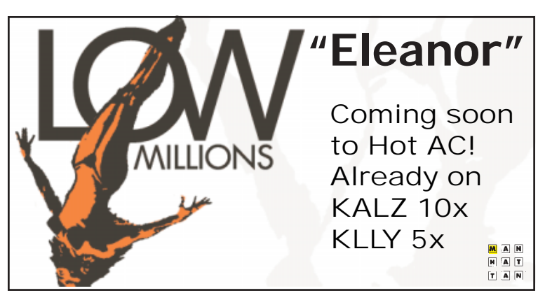
HAC Tip - Low Millions and their single "Eleanor " Adding soon at HAC, but already enjoying early AAA airplay at; WZEW 12x, WRLT 11x, WMMM 8x, WNCS 6x, KINK, WTTS, WXRV and even some savvy HAC stations aren't waiting, such as WHTG, KALZ 10x and KLLY 5x! Audition today! Manhattan