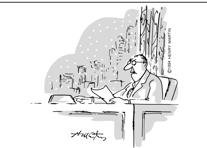
"Miss Anders, get this help-wanted ad in the trades immediately: Wanted - Top-notch communicator! Can you connect?? Can you show me a COMPLETE command of spoken English? Can you PROVE to me that you're the special one-on-one talent I seek? Send T & R. ABSOLUTELY NO CALLS!!"

Conclave XXIX: Paradigm 2004 - It's Full of Shift! July 15-18, Marriott City Center/Minneapolis • www.theconclave.com