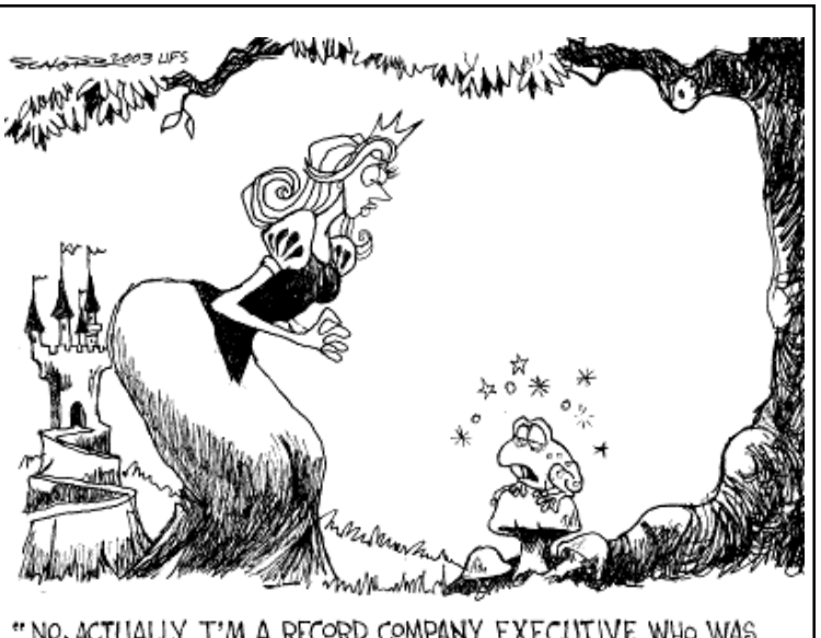
"NO, ACTUALLY I'M A RECORD COMPANY EXECUTIVE WHO WAS CURSED BY MICHAEL TACKSON..."

Ingstad oldies KVMI/Fargo has completed its move from its 96.7 Class A facility, to its new position as a Class C3 signal at 103.9 FM. 96.7 is now dark, while the oldies format has moved to the new dial position. Meanwhile, sister station (former '80s outlet) 100.7 KGBZ has switched to a smooth jazz format, from Jones satellite networks. While some market insiders had believed the jazz format to be a stunt, it appears to be official as the station has also launched a new website at <a href="https://www.fmbuzz.com">www.fmbuzz.com</a>.